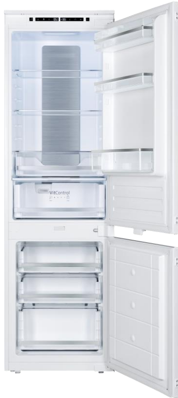
Eurotech 244 Litre Integrated Fridge Freezer ED-IFF190L